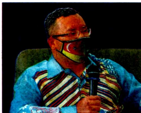
To achieve the smart state agenda, Amirudin says the state govt is expected to disburse all of RM369m allocation from Smart Selangor programmes earlier than scheduled

"This is in line with the MyDigital (Malaysia Digital Economy Blueprint) plan agenda by the