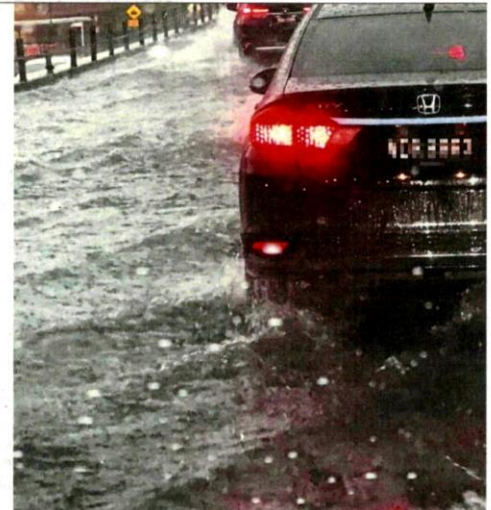
Flooding at the Jalan Universiti flyover on April 13 resulted in two cars breaking down, causing traffic congestion during the evening rush hour.

"The council intends to resurface the road to eliminate the recess and allow excess water to